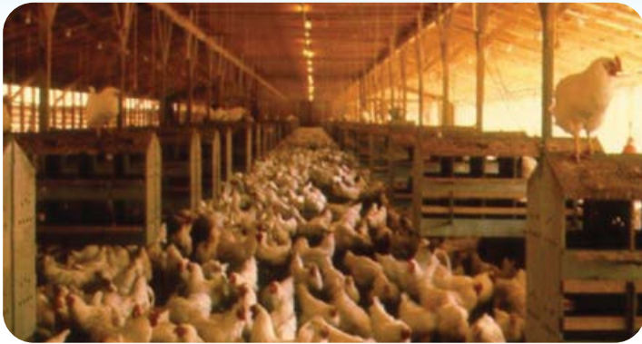
Figure 3: Example of a good manual nest system