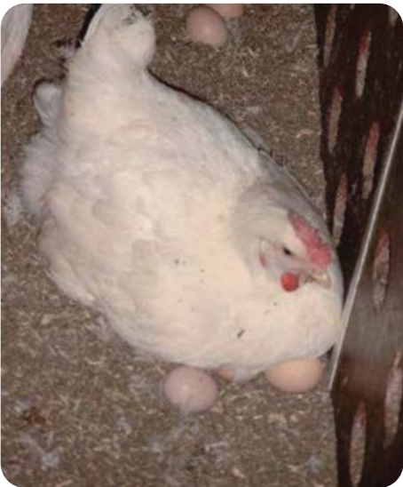
Figure 2: Pullet nesting by solid wall

Pullets looking for alternative nest sites tend to be attracted to dark/shaded areas such as dark or solid walls, corners, the area next to steps and slat fronts and to the area under bell drinkers and nests (see Figure 2). Pullets attempting to establish nest sites should be gently picked up and placed in an empty nest.