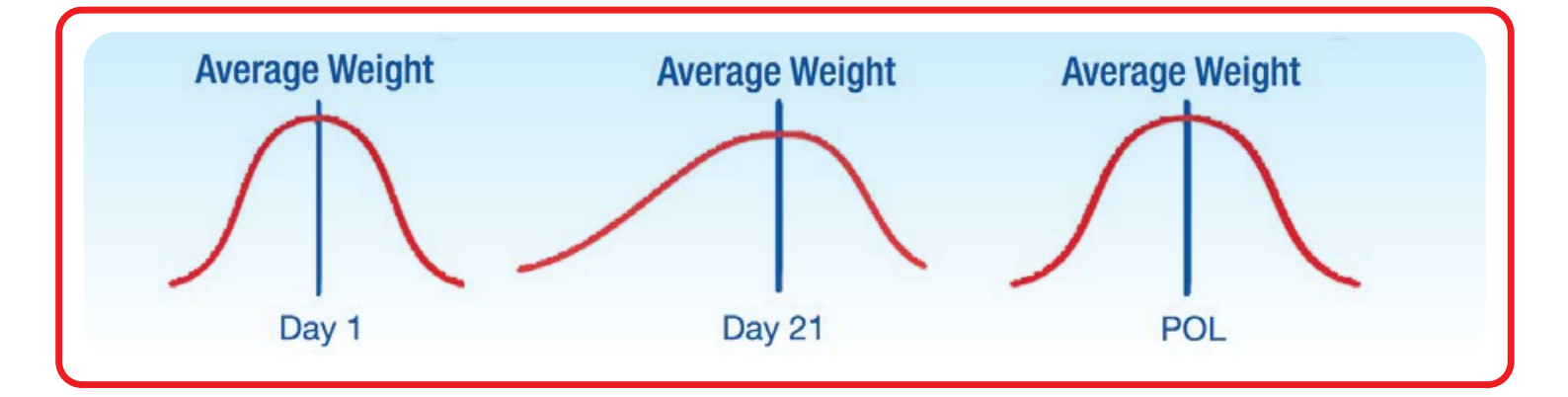
Figure 31: Example of how flock variation changes when the flock is graded at 28 days.

Minimizing variation within the flock makes flock management easier, as all birds will respond in a similar way to management factors such as light stimulation and increased feeding.