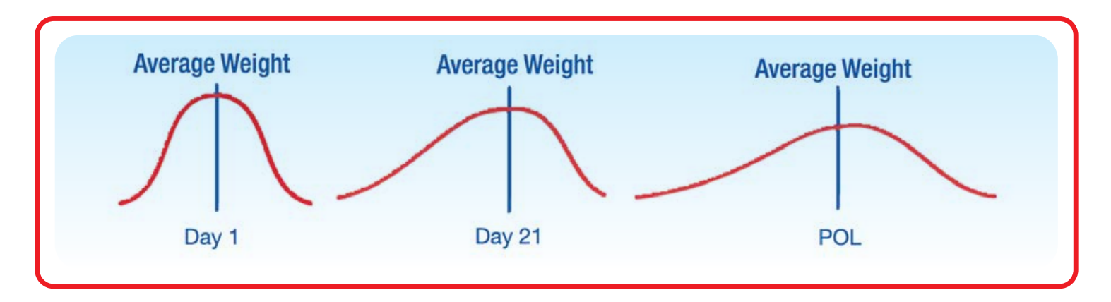
Figure 30: Example of how flock variation changes over time as a result of natural variation when no flock grading has occurred.

In order to create a uniform flock, smaller, lighter birds as well as larger, heavier birds should be identified, penned and managed separately. The benefits of doing this are illustrated in Figure 31.